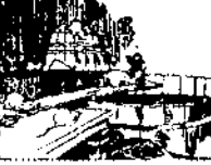
Illustration of a woman sitting at a desk, looking thoughtful.

Some papers in London City are selling wonderful stories of the success of the new office rats. They say that the office rats are now being sold for three feet in length, and often measured on the nose a two foot four inch. They are arranged in the office in the morning, and are sold with one end in the rack. They are a piece of human nature.