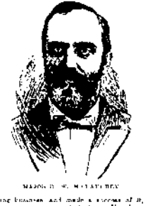
Name of Current Events